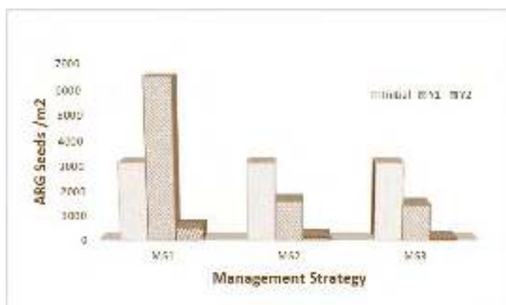
Figure 1. Effect of different management strategies on the weed seed bank, Neaurpur 3 .