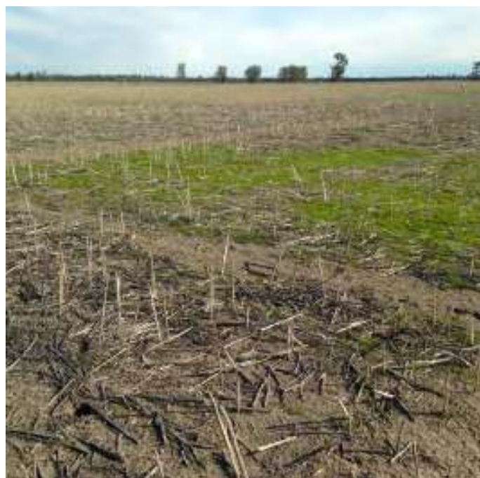
Figure 2. Impact of MS3 (High intensity) on LHS vs. MS1 (Low intensity) on ryegrass populations after the initial canola phase.