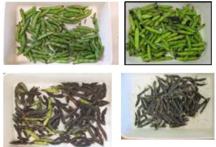
Figure 3 (a-d). Farah faba bean Pod Maturity at Crop-topping timing